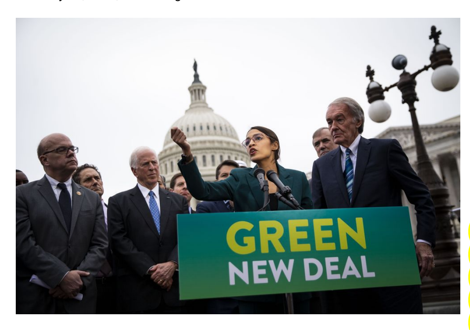
Just the beginning.

By <u>Ari Natter</u> February 16, 2019, Bloomberg