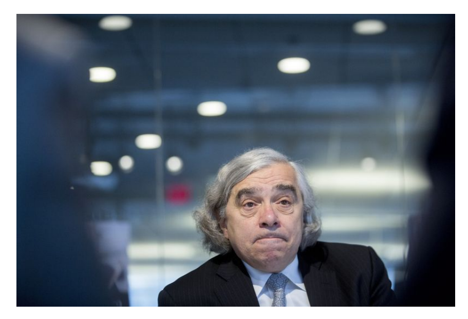
Ernest Moniz